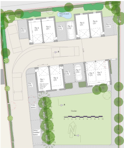
GARAGING & PARKING ALL APARTMENTS