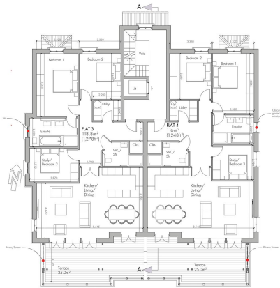
FIRST FLOOR APARTMENT THREE & FOUR