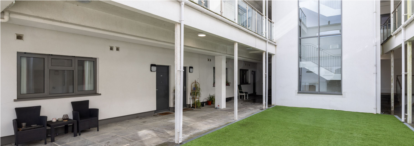
GROUND FLOOR 837 sq.ft. (77.7 sq.m.) approx.