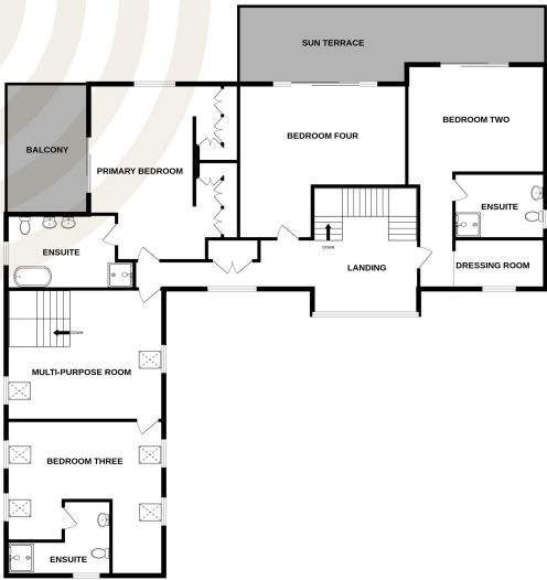
1ST FLOOR 2052 sq.ft. (190.7 sq.m.) approx.

Whilst every attempt has been made to ensure the accuracy of the floorplan contained here, measurements of doors, windows, rooms and any other items are approximate and no responsibility is taken for any error, omission or mis-statement. This plan is for illustrative purposes only and should be used as such by any prospective purchaser. The services, systems and appliances shown have not been tested and no guarantee as to their operability or efficiency can be given. Made with Metropix ©2024