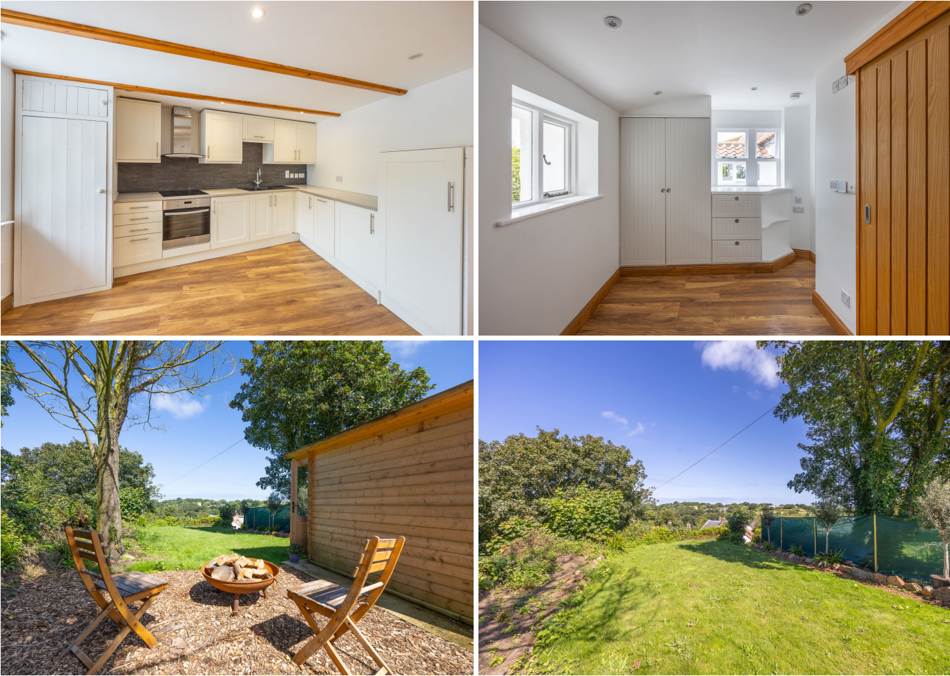
GROUND FLOOR 530 sq.ft. (49.3 sq.m.) approx.